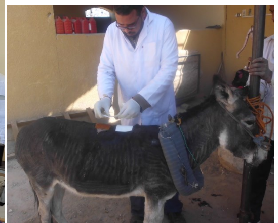
Donkeys like this one will appreciate his efforts though!