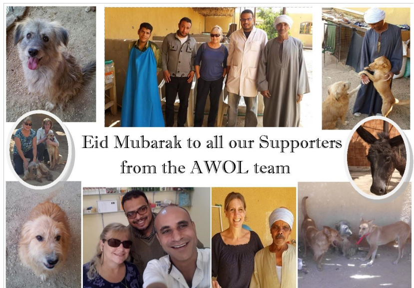
Eid Mubarak to all our Supporters from the AWOL team

Please note that page 4 contains some images of surgery which some people might find distressing. There was a satisfactory conclusion though so all's well that ends well!