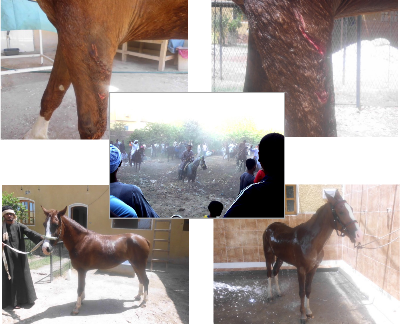
There's always time for a nice cooling shower at the AWOL centre!

Both of the horse pictured were suffering from cuts sustained during a moulid race but thankfully none of the injuries were too severe and after treatment they will make full recoveries.